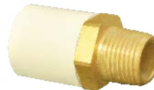
R - MTA