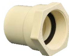
FEMALE THREAD ADAPTOR