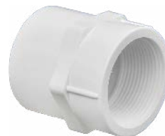
FEMALE THREAD ADAPTOR