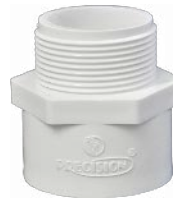
MALE THREAD ADAPTOR