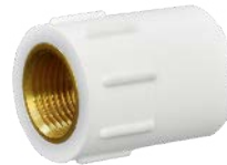
R - FTA