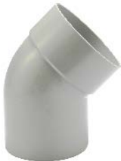
SHOE BEND 45°