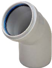
SHOE BEND 45°