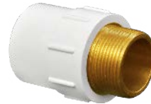
R - MTA