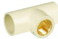
R - TEE