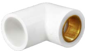
R - ELBOW