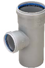
REDUCING SINGLE TEE