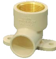
R - ELBOW