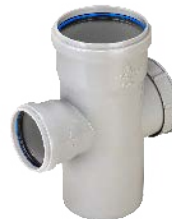
REDUCING SINGLE TEE