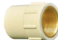
R - FTA