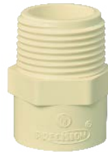
MALE THREAD ADAPTOR