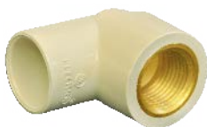
R - ELBOW